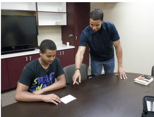
Mentoring, Tutoring and SAT Prep