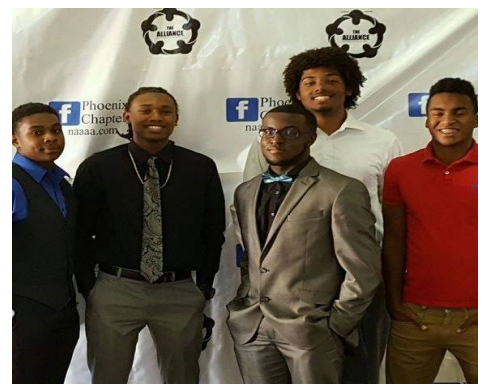
Annual Arizona Awards Ceremony