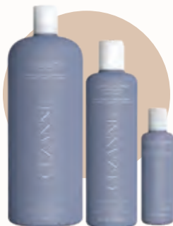
CLASSIC BLONDE (FORMERLY ULTIMATE BLONDE)