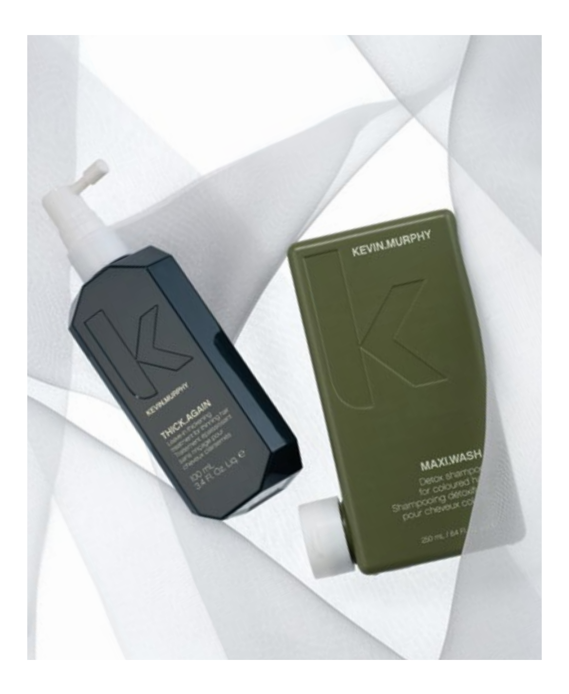
MAXI.WASH — BALANCING.WASH — STIMULATE-ME.WASH STIMULATE-ME.RINSE — THICK.AGAIN

Give hair and scalp a much-needed DETOX. Wash away unwanted mineral and product buildup while a stimulating blend of Camphor, Bergamot, Mint and Black Pepper invigorate, strengthen and revitalise the hair and scalp.