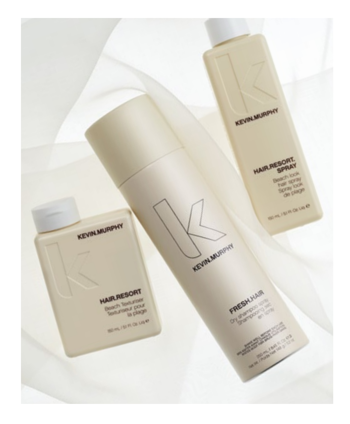
HAIR.RESORT — HAIR.RESORT.SPRAY — FRESH.HAIR