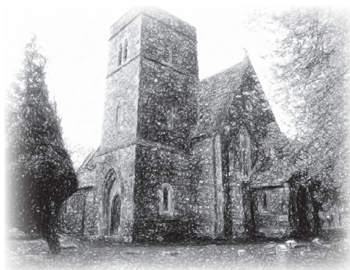
St. Katharine Felton