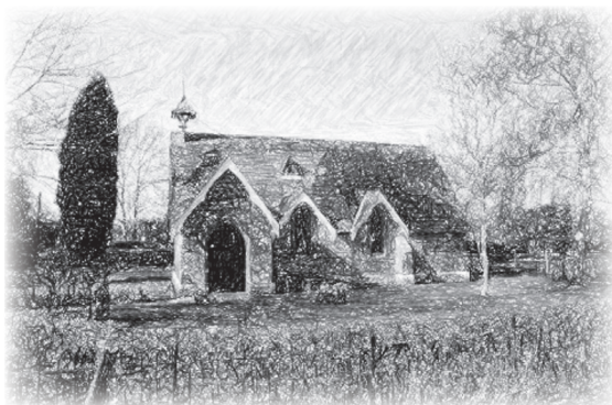
St. James Regil