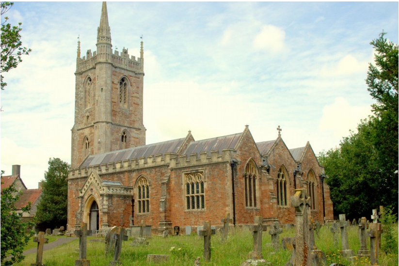
St. Andrew's Church, Chew Stoke May 2015