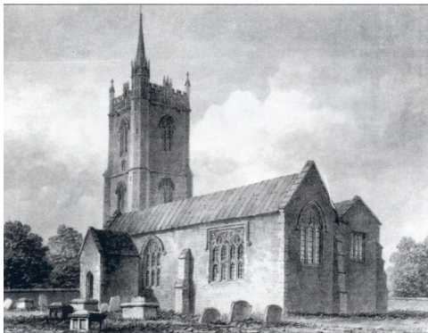
The Church before 1863.

empty, and the number of scholars halved as children as young as six were required to work. Families moved away in search of work, and only 36 surnames recorded in the 1851 census remained in 1871.