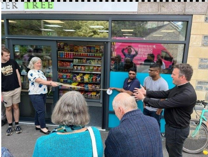
Grocertree Village Shop opens!