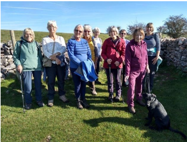
Members enjoying a delightful walk at Deer Leap at Priddy on a glorious Autumn day

8.12.21. 7.30 pm Members meeting in the Hall