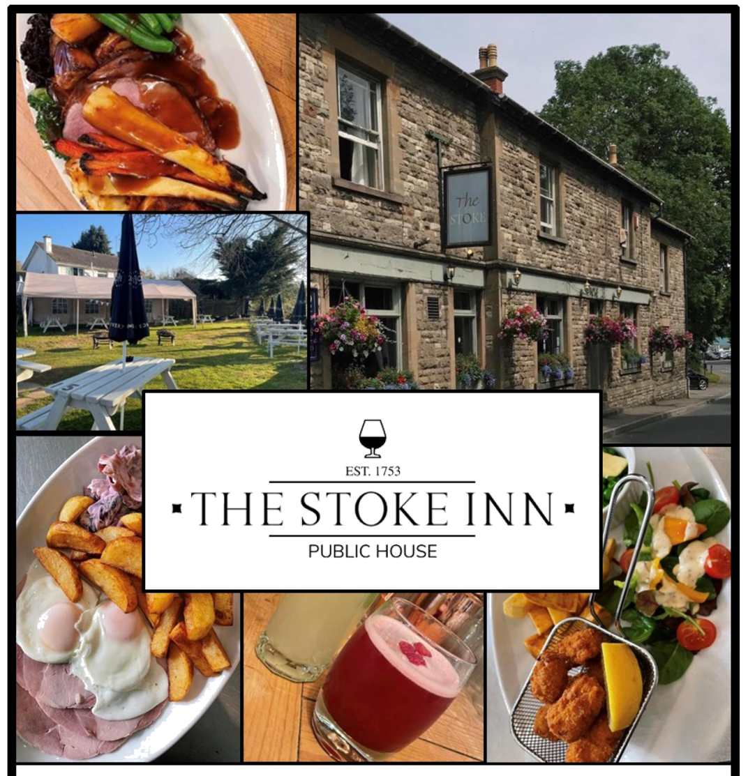
Enjoy our covered courtyard & enclosed grass beer garden!