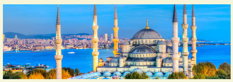
Day 4, Easter Sun, April 17: Constantinople - Explore the Byzantine Empire

Day 3, Sat, April 16: Istanbul - Discover the Ottomans Visit the Blue Mosque and learn about Islam. Walk through Topkapi Palace, home to the sultan. After lunch, wander through the intricate maze at the Grand Bazaar and Spice Market. Enjoy free time as you sample Turkish delight and have a cup of mint tea. After dinner, enjoy the rhythmic dancing of the whirling dervishes for whole cities lived underground going all the way a performance. Overnight: Istanbul. (B, D)