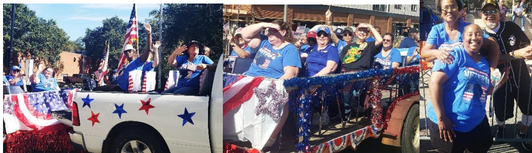
On the float