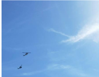
First time for parade, flyover! One of the HUEY's piloted by Captain Jones (female)