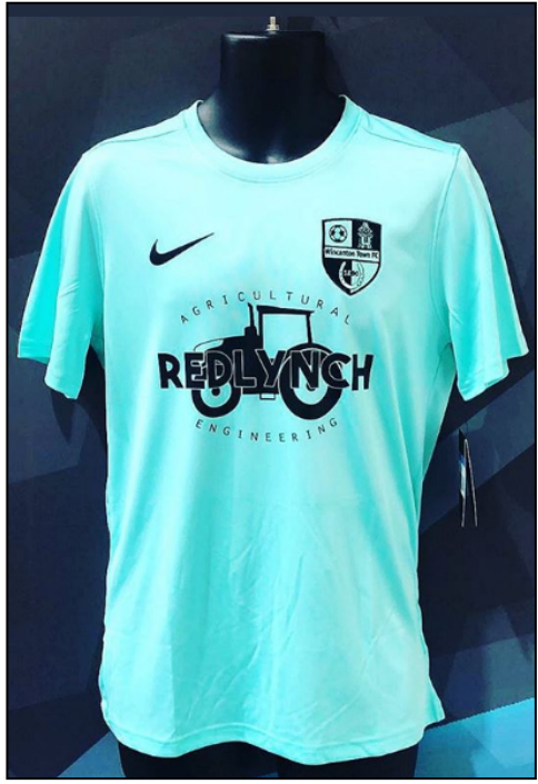
(Above) Our home and away shirts. The home shirt is sponsored by SRM Carver and Son, whilst our away shirt is sponsored by Redlynch Agricultural Engineering.

(Below) During the summer some of the players and committee have been busy with their paint brushes tidying up Moor Lane and in particular the Don Champion Stand.