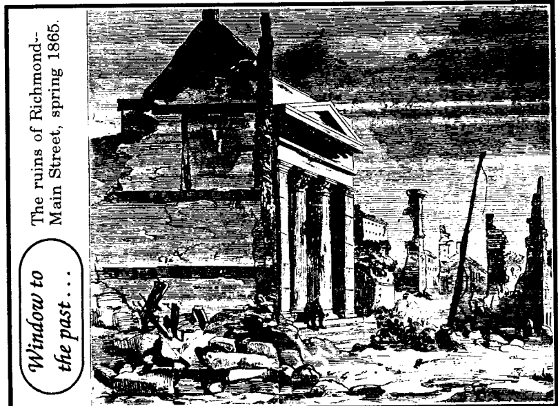
The ruins of Richmond-- Main Street, spring 1865.