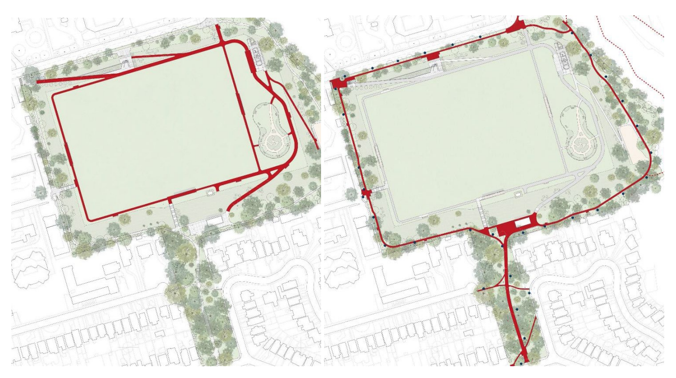
Left: Upper Perimeter Pathway and Service Road. Right: Lower Perimeter Pathway (red) and light poles (blue)