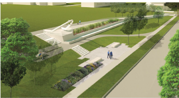
Illustration of Gateway and Water Feature (including Water Molecule) on Rosehill Avenue, looking west. Details may change after the printing of this notice.

Location: Christ Church Deer Park, 1570 Yonge Street, Elliot Hall