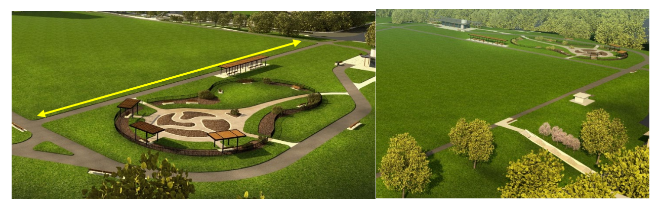
Left: The eastern segment of the Upper Perimeter Pathway widened to 3.0 metres