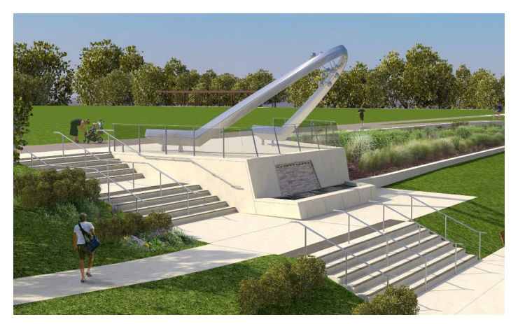
Centennial Monument and Water Feature on Rosehill Avenue