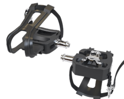
Standard Morse Taper Double Link™ pedals