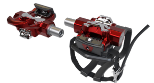
Morse Taper Triple Link™ Delta-compatible pedals

Core Health & Fitness is more than gym equipment, we offer innovative solutions for all your facility needs. This is why we've brought together five of the most recognizable fitness brands to ensure our customers can offer their members authentic fitness experiences. Whether working with us directly or through our partners and distributors worldwide, we provide the highest quality equipment backed by a service and support team that will always go the extra mile to get you what you need, when you need it. Partner with us and see how our Core Values motivate our every decision.