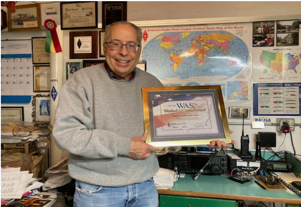
My ARRL “WAS” Certificate arrived last week!

After 58 years as a Ham, I finally earned my Worked All States award! It was fun going through my real QSL Cards and checking off each state on the ARRL official form and filling in the info for each state. I contacted one of the ARRL card checkers here in CT, and he confirmed my QSL cards for verification. The process was easy.