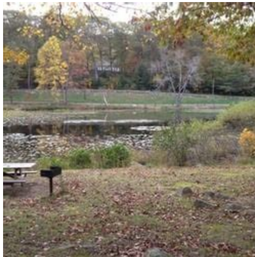
Putnam Park POTA Site