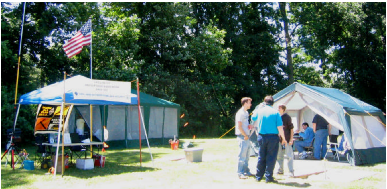
Photos from Field Day 2007