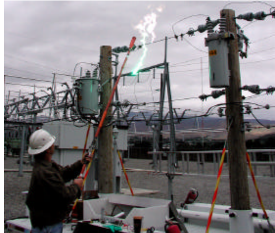
(Metal pole in contact with high tension wires...Don't let this happen to you!!)