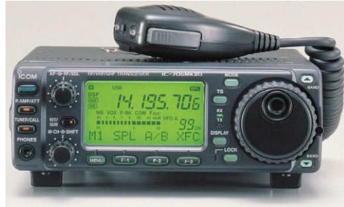
We've come a long way!

This celebration will be going on during the rest of 2011 so if you come across something let us know. Who knows, if we get massive amounts of stuff we may extend the Anniversary into 2012!