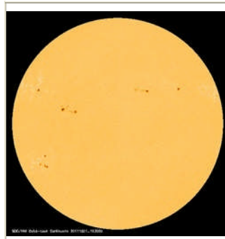
The Sun, as seen on Thursday, December 1, 2011 from NASA's SOHO Extreme Ultraviolet Imaging Telescope . This MDI (Michelson Doppler Imager) image was taken in the continuum near the Ni I 6768 Angstrom line. The most prominent features are the sunspots. This is very much how the Sun looks in the visible range of the spectrum.

third of six batteries was approaching failure to short, and observations indicate the voltage from three cells is insufficient to power the UHF transmitters. The IHU [internal housekeeping unit] may continue to be operative. Initial tests with the S band transmitter were also not positive, although more attempts are in order. We have tried leaving the satellite in an expected state where if voltages climb high enough, the 435.150 transmitter may possibly be heard. The command team will regularly attempt communications with the satellite over the coming months (and years). There is always the possibility that a cell will open and we could once again talk to our friend while illuminated. Thanks to all who helped fund, design, build, launch, command, and operate AO-51. Its 7 year mission has been extraordinary."