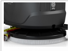
SPIN-ON, SPIN-OFF BRUSH