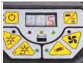
INTUITIVE CONTROL PANEL