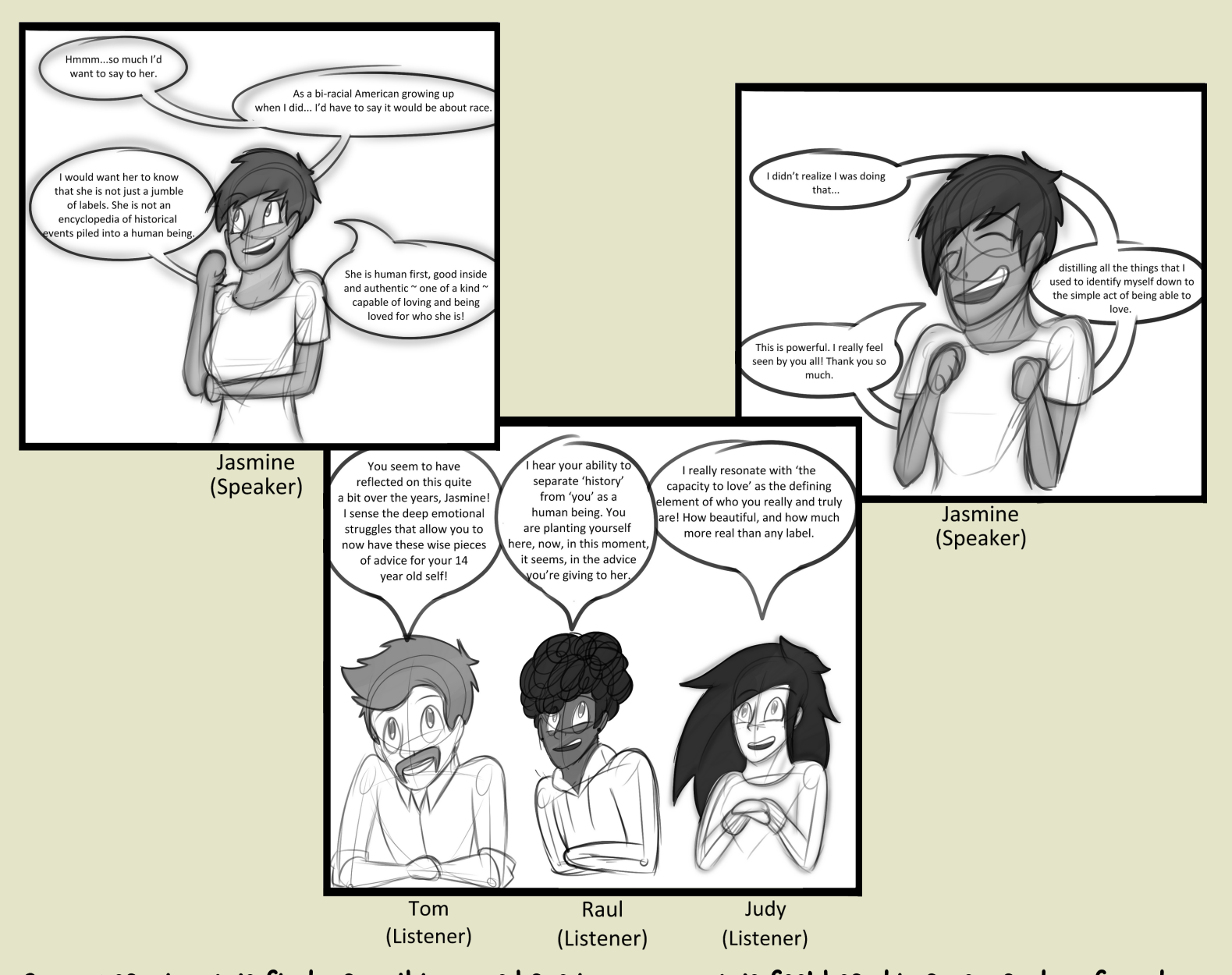
Group Learning: We find many things we have in common. We feel heard in a new and profound way. We validate our experiences and see how we've each struggled with hard things that became our strengths. Maybe that's part of what it takes to grow up! We also felt "seen" by each other in this process. This feels affirming.