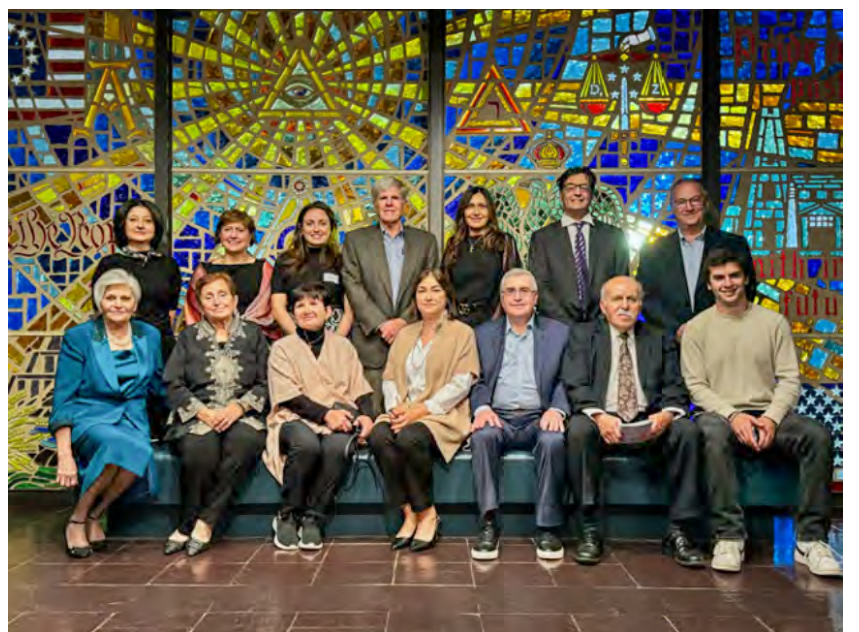
Members of St. Gregory Church at the Vehapar Concert.