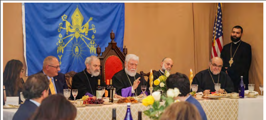
Banquet at St. Gregory church

Our parishioners and esteemed guests gathered for the “Hrashapar” Service and “Achahampouyr”, followed by a celebratory banquet in honor of Vehapar in the Church Hall.