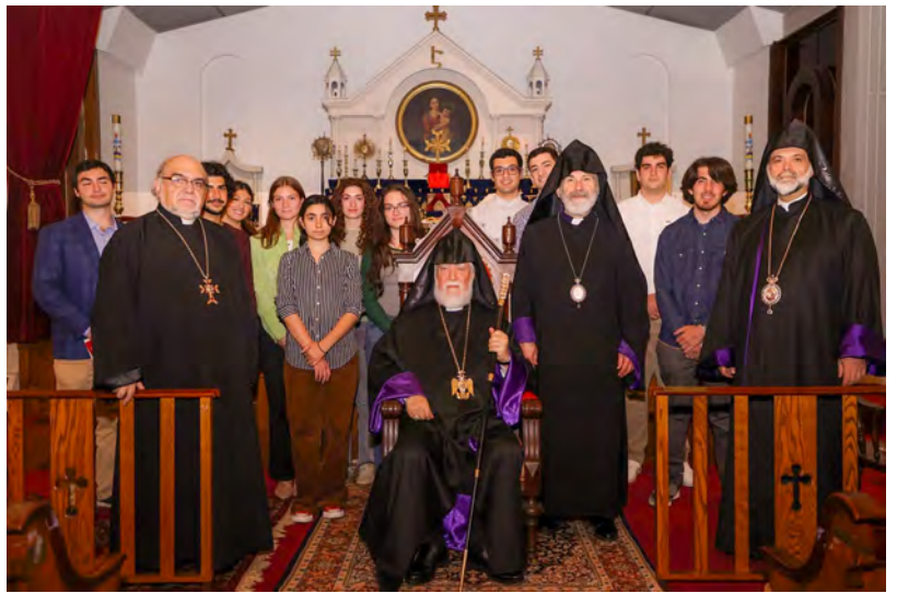
Vehapar with St. Gregory youth and UMASS students