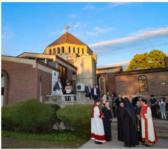
Waiting for Vehapar's arrival at St. Gregory