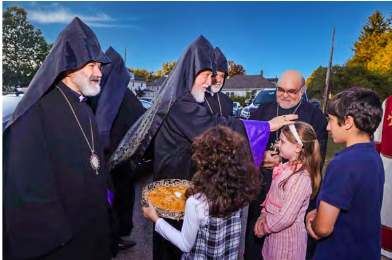
Church youth welcoming the Vehapar with bread and salt.