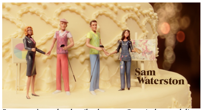
Props are also used to describe character: Grace is sharp and direct like the pointer stick for her business presentation while Frankie is more open and colorful like her paint palette and canvas.