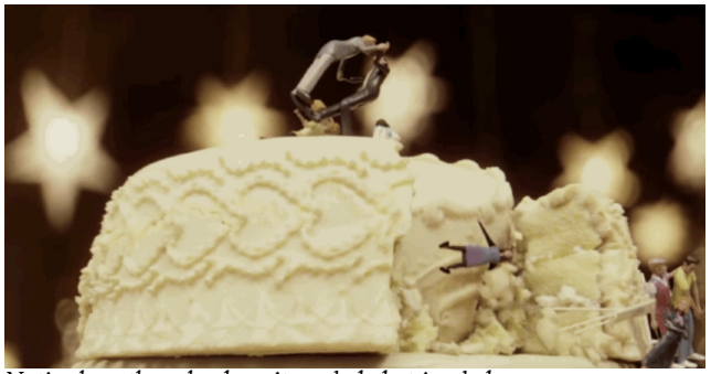
Notice how the cake doesn't explode but implodes.

central themes of the narrative. Having such a firm grasp of not only the story but also the characters make it a great introduction for any viewer to pick an episode at random and feel completely immersed within the narrative: and that is nothing short of a masterpiece.