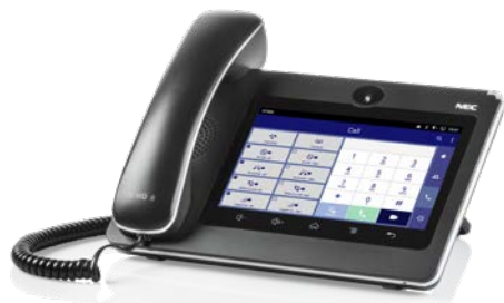
GT890: IP Desktop Video Telephone