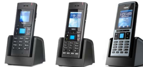
DECT handsets: for any working environment