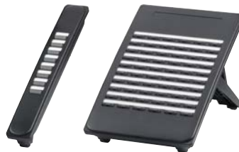
8-line Key Module / 60-line DSS Console