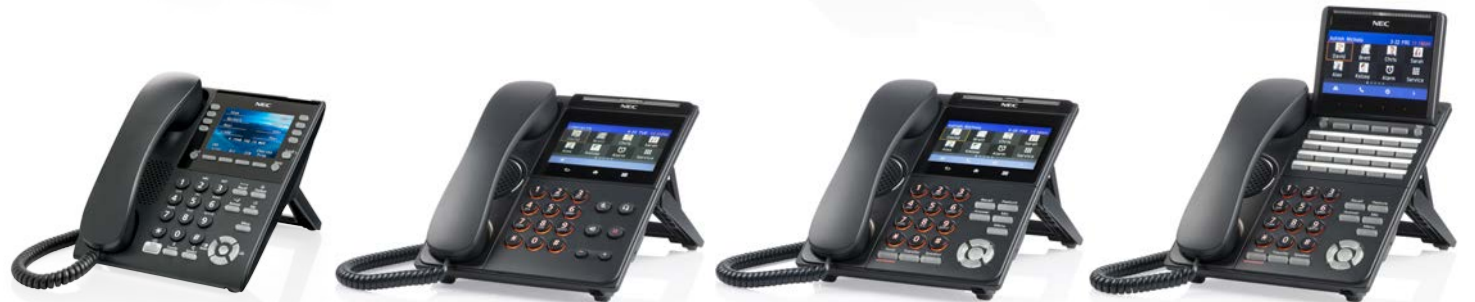
Color: Easy call control from the office, remote or home-based working, hot-desking