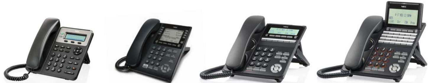
Mono: Easy call control from the office