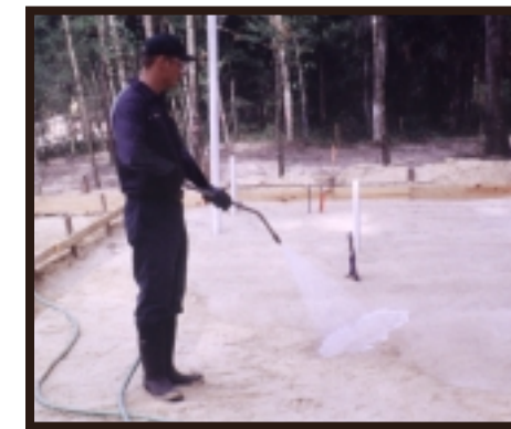
Application of termite protection chemicals during construction.

health effects. These products were replaced with pesticides considered to be safer for the environment and human health. But these characteristics also made the products less effective for termite protection. While chlordane generally lasted more than 30 years, currently available materials last only five to 15 years, and require more precise application.