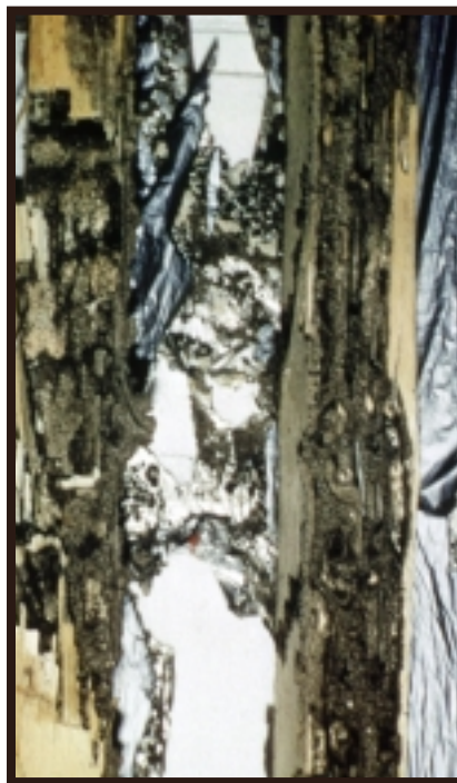
Subterranean termite damage to wall studs.