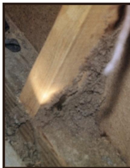
Termite shelter tubes on wall stud.