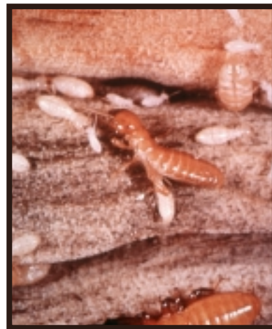
Subterranean termites—workers and reproductives.

One of the most prevalent and dangerous wood-destroying organisms is the subterranean termite, which can cause significant wood damage to a house and other structures. The termite's activity generally goes unnoticed until extensive damage becomes visible, and the economic impact is substantial.