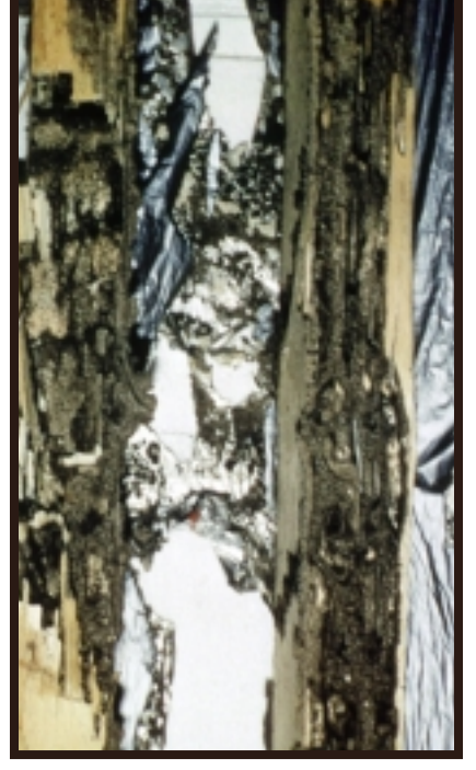
Subterranean termite damage to wall studs