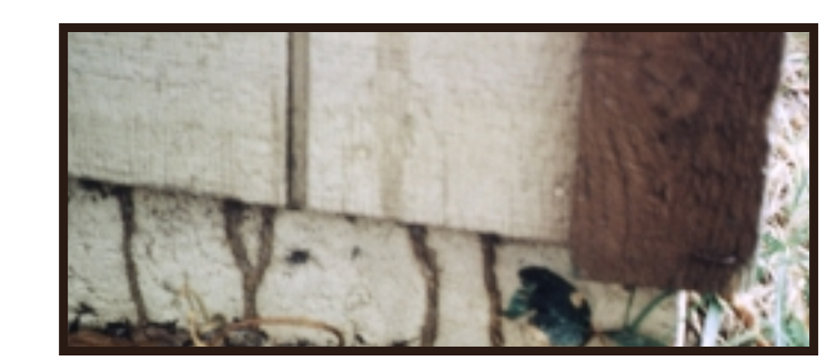
Termite shelter tubes entering structure.

Contracts and warranties for post-construction treatment vary from company to company. However, the use of some terms in a contract have been specified in law, Florida Statutes, Chapter 482.227