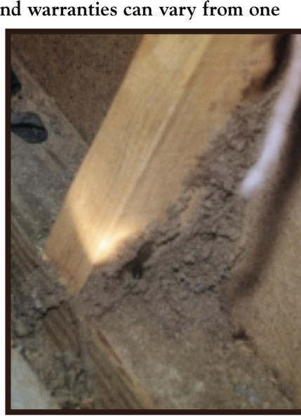
Termite shelter tubes on wall stud.