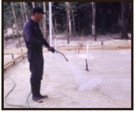
Application of termite protection chemicals during construction.

health effects. These products were replaced with pesticides considered to be safer for the environment and human health. But these characteristics also made the products less effective for termite protection. While chlordane generally lasted more than 30 years, currently available materials last only five to 15 years, and require more precise application.