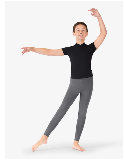
Grey/Charcoal dance leggings