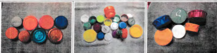
Drink Bottle Caps