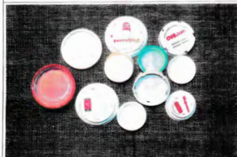
Medicine Bottle Caps with any cardboard inserts removed