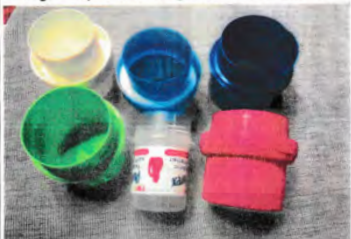
Detergent Caps with white gasket and label removed