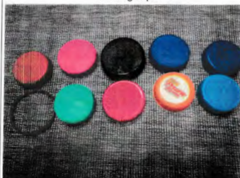
Milk Jug Caps