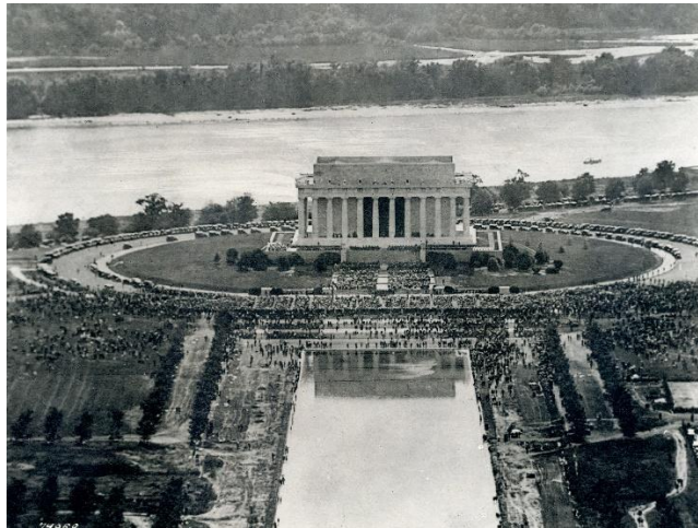
Dedication Photo: May 30, 1922

https://www.usace.army.mil/About/History/Historical-Vignettes/Parks-and-Monuments/152-Lincoln-Memorial/