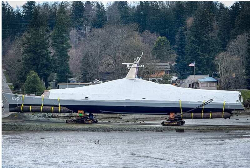
Serco North America