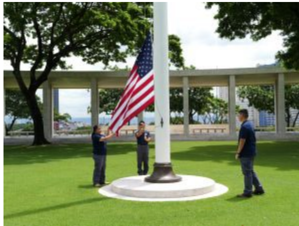
Manila American Cemetery Sojourn 250

As part of America’s 250 th Anniversary the American Battle Monuments Commission has flown the same U.S. flag at all 26 overseas cemeteries in 2025. To learn more about the largest ABMC cemetery located in Manila, click on this link. https://www.abmc.gov/video/manila-american-cemetery/?utm_campaign=Website