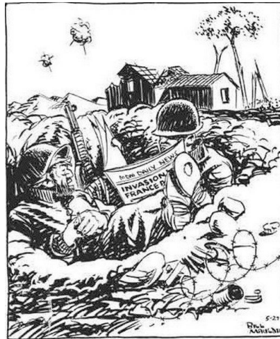
"Th' hell this ain't th' most important hole in the world. I'm in it."