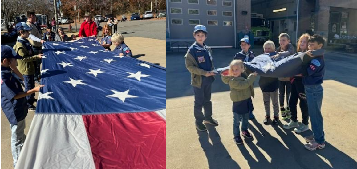
Scouts with Troop 1995 helping to fold a large U.S. Flag