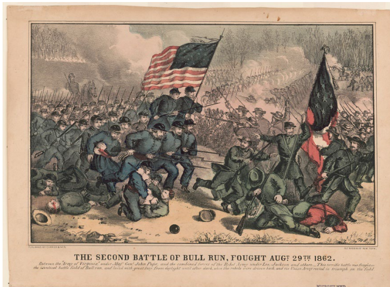
The Second Battle of Bull Run August 29 th , 1862 See page 13 for information on a 1913 movie of the battle.