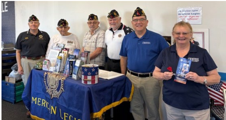
The usual Post gang recruiting at the Coast Guard Exchange