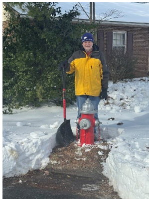
Adjutant Hunter by his assigned fire hydrant

This recent snow storm and the plowing afterwards in many cases overwhelmed roadside fire hydrants in neighborhoods. Fairfax County has a program to promote fire hydrant stewardship by residents living near a hydrant. The task is simple, keep vegetation and/or snow away from the hydrant to make them clearly visible in case of a fire in the area. If fire fighters have a hard time locating the nearest hydrant, they waste critical time in starting to extinguish fires at residences or vehicles. If you live near a hydrant, volunteer to adopt it...it is a reportable community service project for hours. The fire department even sends you a certificate recognizing your contribution to fire safety.