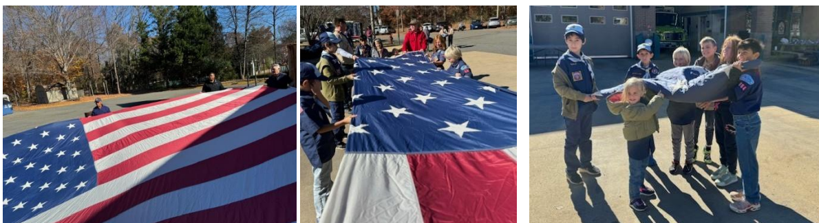
Scouts helping to fold a Garrison Flag (20 x 38 feet) More photos will be included in the December newsletter