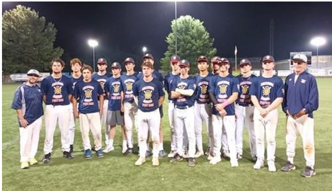
Post 1995 - 2024 American Legion Baseball Team

Legion Baseball – The team we sponsored from Arlington this year peaked at just the right time. What started as a mission of mercy for the youth from Arlington turned out to be an exciting end of the season. In the All-Star Game one of our players hit the game ending run and another was voted the MVP. After an up and down start to the season we made it into the 17 th District playoffs and the championship game against Vienna Post 180. We lost but qualified for the Department (State) Tournament. We played two very good teams very close but bowed out with the confidence we belonged there. What I want to stress is that these young men and their families are very good people and grateful to Post 1995 for sponsoring a truly fun season.