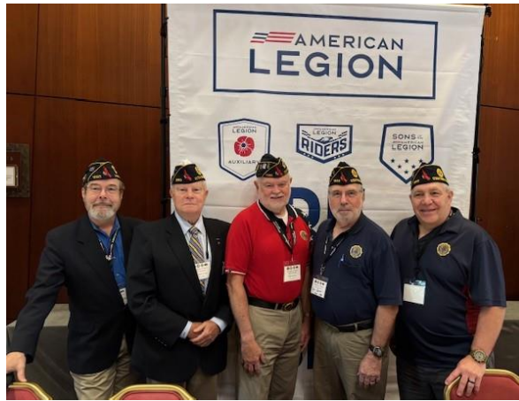
Group photo of Post 1995 members attending