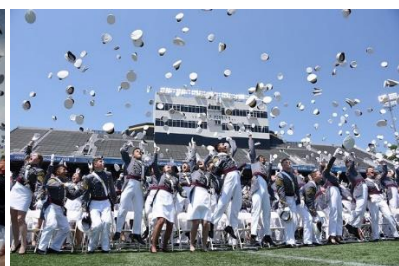
Army (West Point) Academy West Point Assn of Graduates