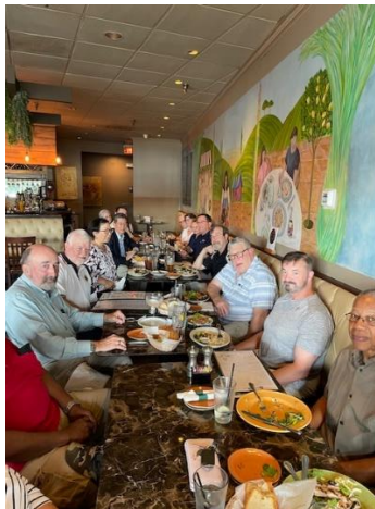
Some of the attendees at our August Social