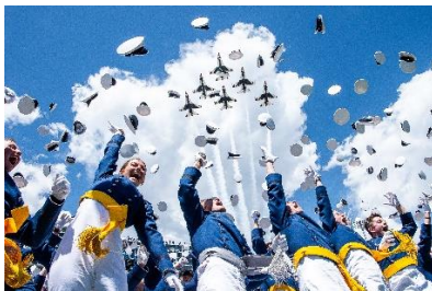
Air Force Academy