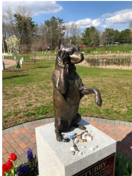
Sergeant Stubby giving a salute...read his story below