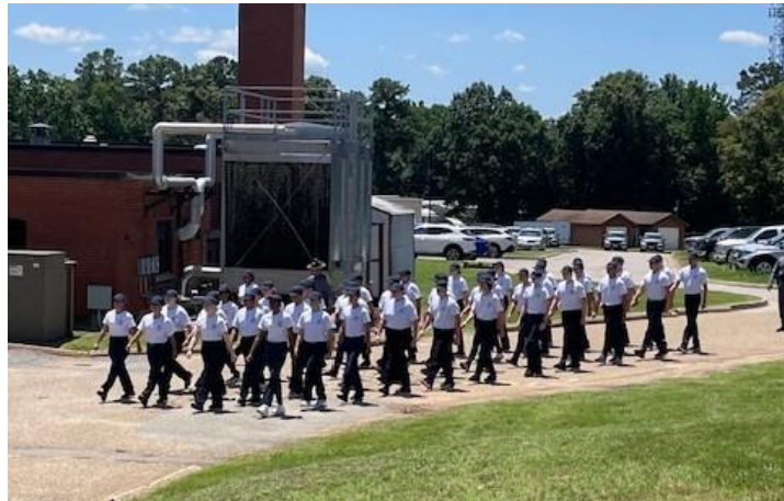
Cadets marching to training