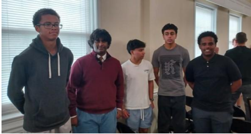
Five (5) of the eight (8) Post 1995 sponsored students attending Boys State in 2025

Jon Bon Jovi, Musician Bruce Springsteen, Astronaut Neil Armstrong, and News Anchor Tom Brokaw. We wish all the delegates from Post 1995 similar success!