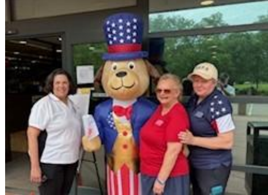
Auxiliary Members with "Patriot Dog"