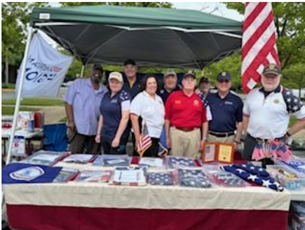
Post/Auxiliary Units 1995 members

The Post held its first ever Flag Day educational event at the Chantilly Regional Library on Saturday June 14 th from 10:00-13:00. While the public attendance was not what we were hoping for, it is a start. Other large competing events such as the parade in D.C. impacted the turnout. We demonstrated how to properly fold the U.S. flag, displayed numerous historical U.S. flags, and provided their histories. The Auxiliary provided cupcakes and flag coloring pages for students. Leftover cupcakes were donated to Fire Station 38 and the Sully District Police Station.