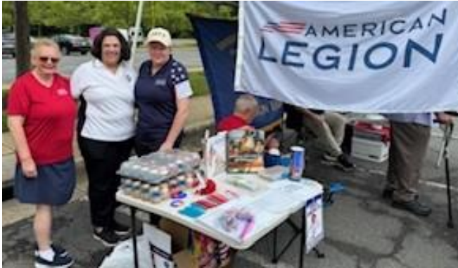
Auxiliary Members at the crafts table