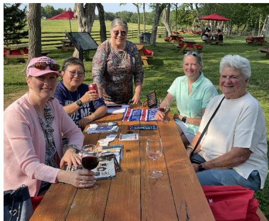
Post Veterans attending our first Women Veterans Social