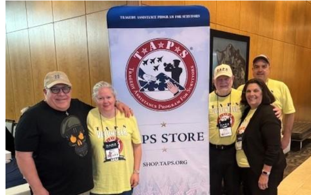
Post/Unit 1995 TAPS volunteers