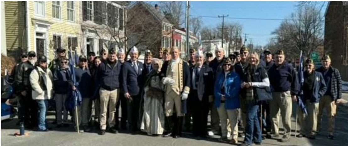
American Legion participates in the Alexandria President’s Day Parade