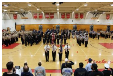
2026 JROTC Competition

On February 22 nd The American Legion Department of Virginia hosted its 2 nd JROTC competition since COVID-19 closures. Gloucester High School was kind enough to host us as we held 10 events that were well attended by 18 High Schools across all three regions of the state of Virginia. There were 24 judges and many more volunteers among The American Legion Department of Virginia from all three regions and many more Legionnaires who were present to observe the hard work and dedication of these young men and women during their JROTC drills. Even the Marine Corps League came out to give us a hand on this fabulous day of events. Congratulations to all of the JROTC units that were present for the competition, especially to Unity Reed High School JROTC program from Manassas, VA, who won first place overall. To see all 77 photos posted on Facebook by the Department's Judge Advocate, see this link : The Chantilly JROTC program did not attend.