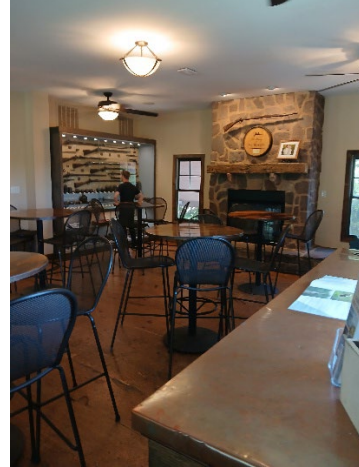
Bull Run Winery