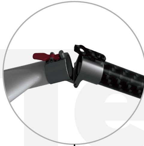
V-Tail Folding Structure