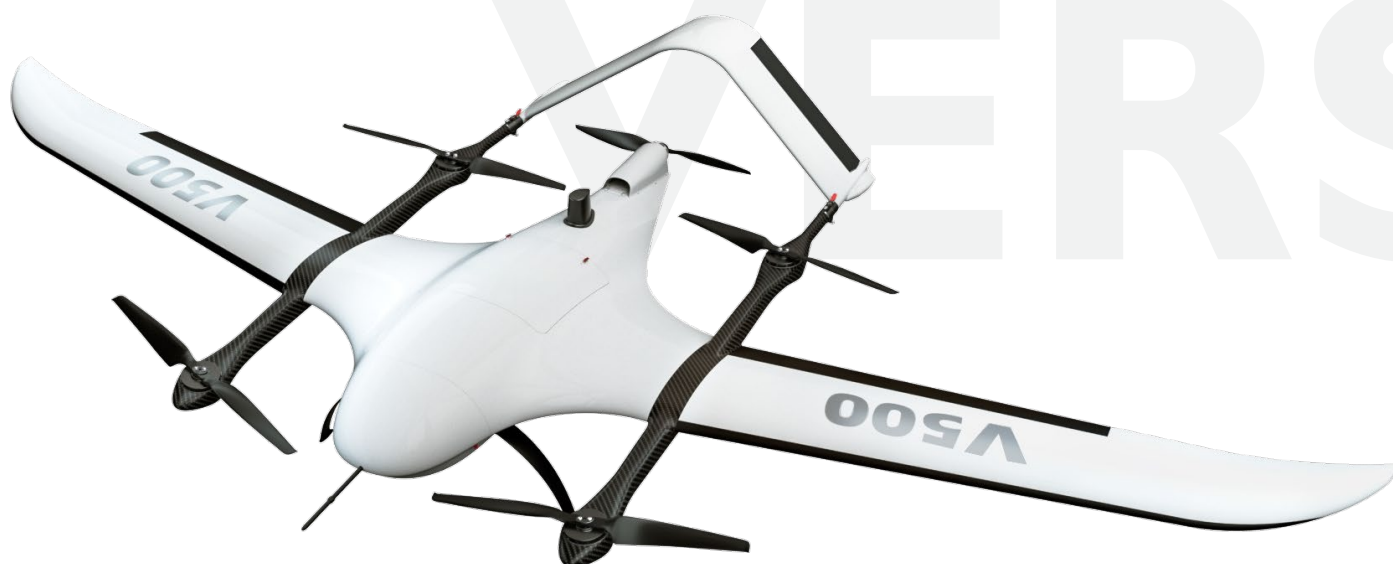
Orthophoto and Oblique Version