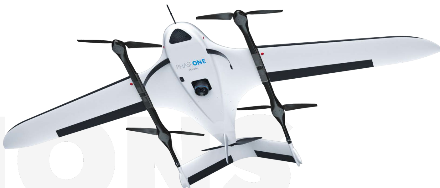
Phase One Version