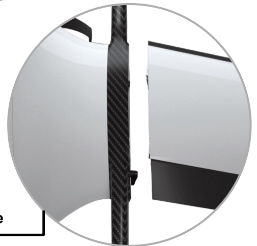
Quick-Release Wing Structure