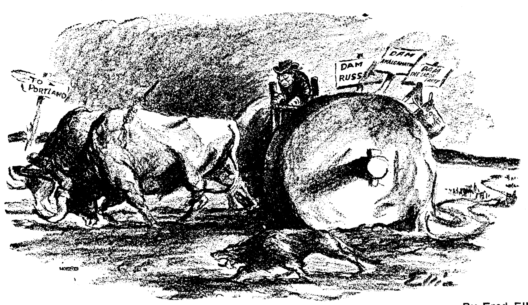
THE UNCOVERED WAGON.