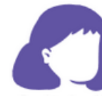
Daughter (age 12)