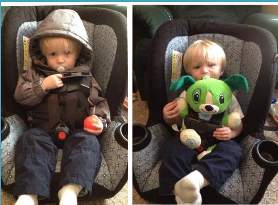
This shows how much extra room there is beneath the straps after his winter jacket was removed.

Puffy coats and snowsuits are great at keeping kids warm in winter months, but remember to take them off of your child before securing them in their car seat. In the event of a crash, the bulky material will compress and make the harness straps too loose on your child. When harness straps are too loose, they aren't doing their job of helping your child stay safe!