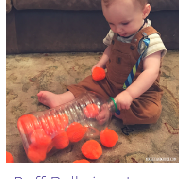
Puff Balls in a Jar: <a href="https://tinyurl.com/2p83bkbz">https://tinyurl.com/2p83bkbz</a>