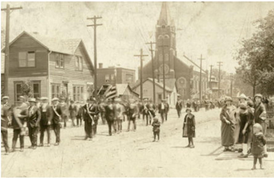
Slovenian Parade on St. Claire Street with Holy Trinity Church in the background.