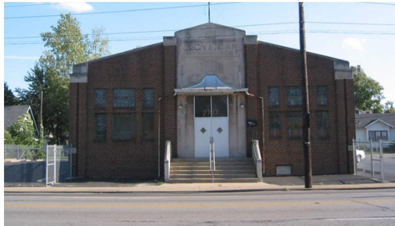
Slovenian National Home Indianapolis