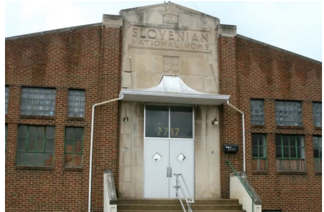
Slovenian National Home of Slovenian Culture in Indianapolis

We are calling on you, our Slovenian family to help us restore our landmark building. The sooner we can raise these funds, the sooner the repairs can begin.