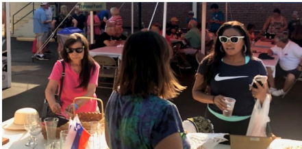
Shopping in Haughville ?