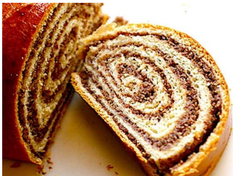
Slovenian Potica (walnut roll)

Potica will be baked by our dedicated "Potica Team" of Slovenian National Home and served at our 2022 Slovenski Festival.